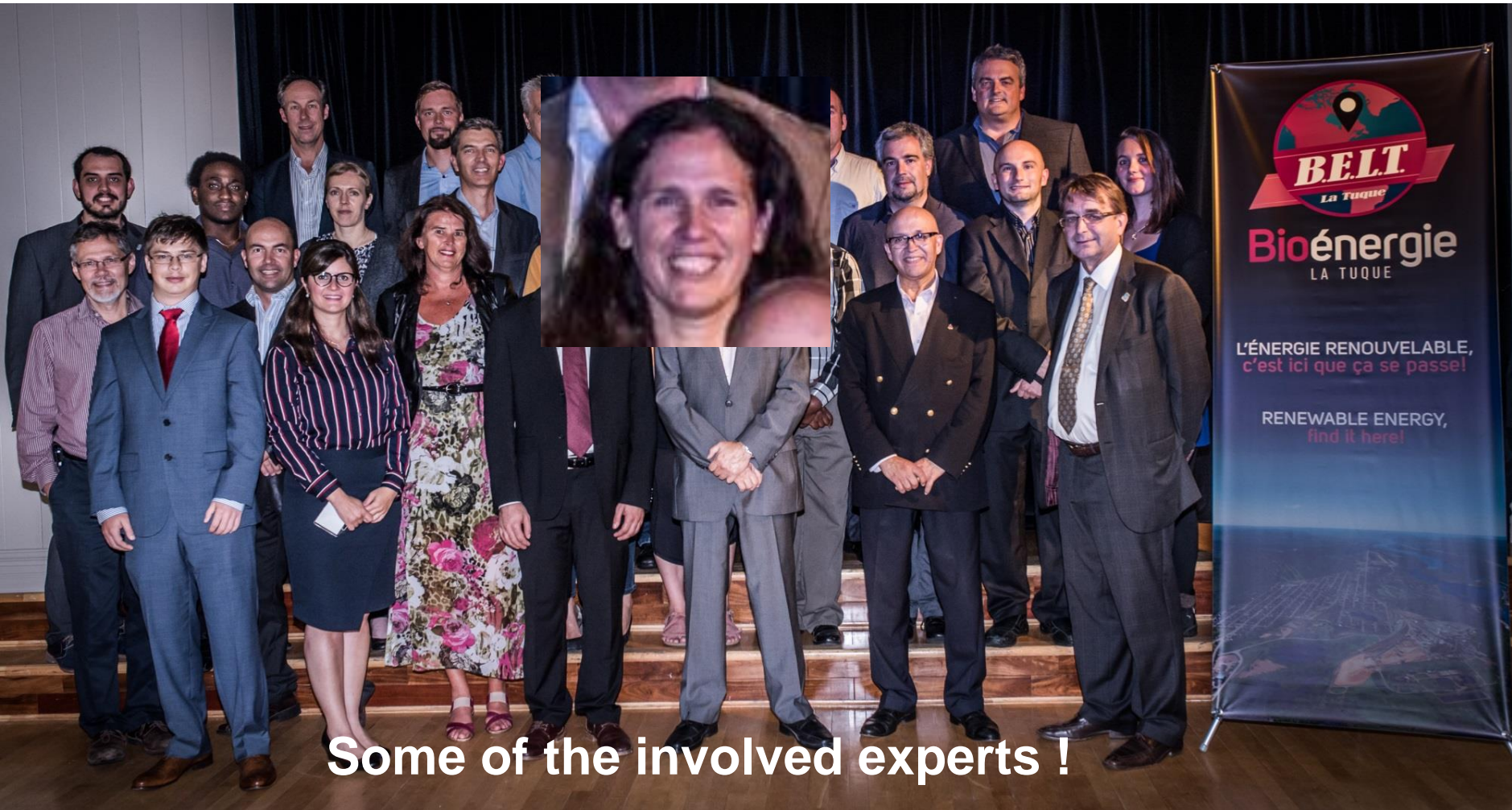
Some of the involved experts !