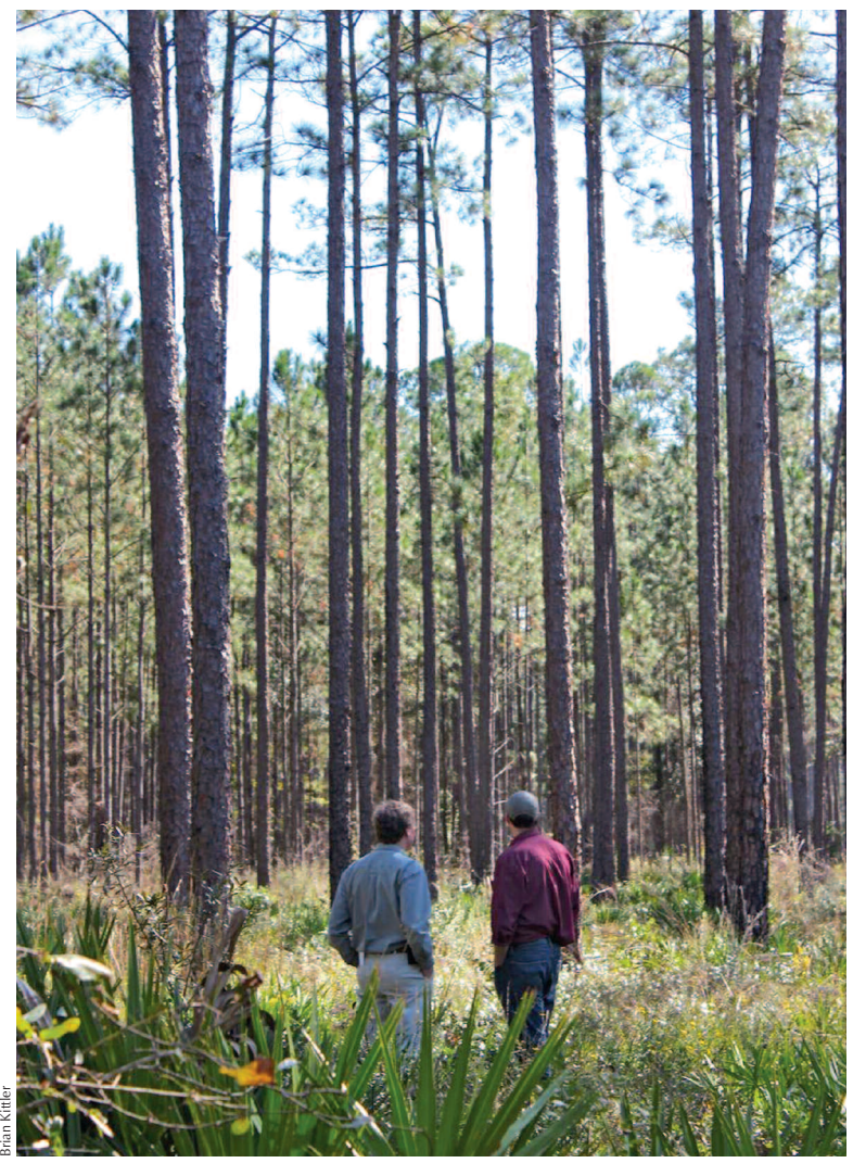
Workshop participants on the field study tour in southeast Georgia.

This workshop was convened by the Pinchot Institute for Conservation with support from the International Energy Agency (IEA) Bioenergy Tasks 40 and 43. The Georgia Forestry Commission and Plum Creek Timber Company led the organization of the workshop field tour. This event was made possible with generous support from the Programme for the Endorsement of Forest Certification Programs (PEFC), the Sustainable Forestry Initiative (SFI), IEA Bioenergy Executive Committee (IEA Bioenergy ExCo), E.On, MeadWestvaco Company Foundation, and Weyerhaeuser.