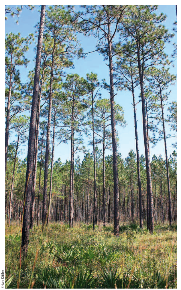
Longleaf Pine habitat in the foreground, adjacent to densely planted Loblolly Pine in the background.

All of these efforts focus on requirements for sustainable forest management and third-party verification. Other elements of proposed frameworks include requirements for: