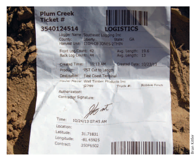
A timber harvest load ticket used to track harvested wood in Georgia's fiber market.

Among these suggestions, the idea of a risk-based approach, e.g. regional or supply chain level risk assessments came up more than once from both European regulators and buyers. This concept was discussed in association with the UK's Central Point of Expertise on Timber Procurement (CPET) and again with the Sustainable Biomass Partnership (SBP formerly the Industrial Wood Pellet Buyers), a coalition of seven European power companies. The SBP is aiming to be