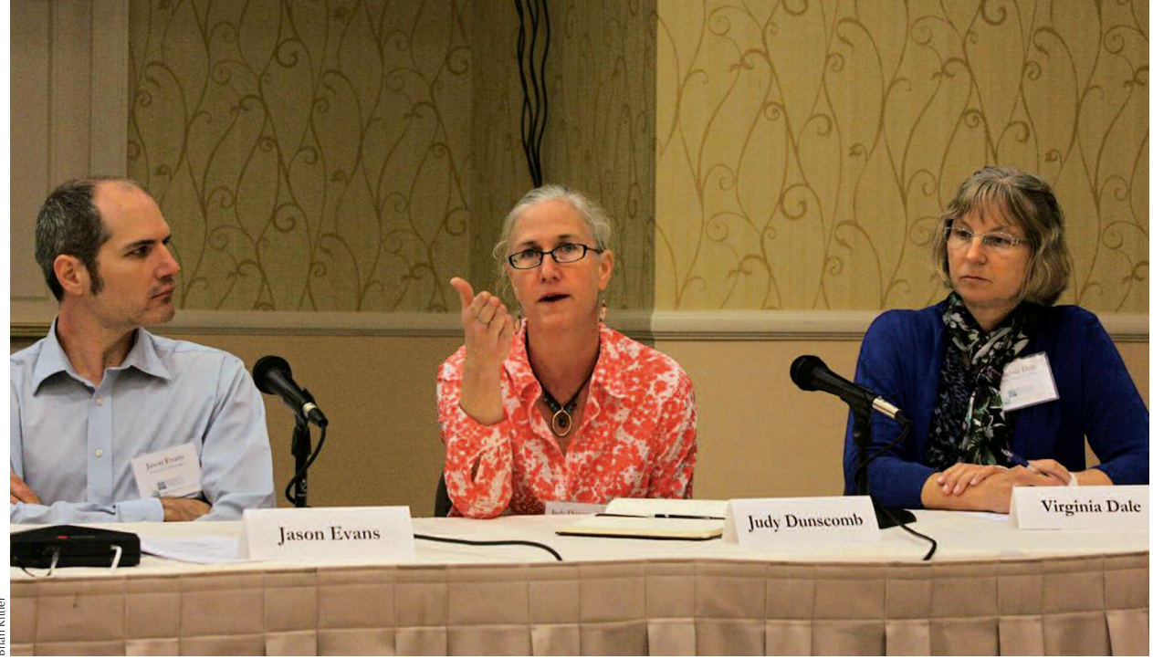
Savannah workshop panelists discuss biodiversity conservation strategies for the South.