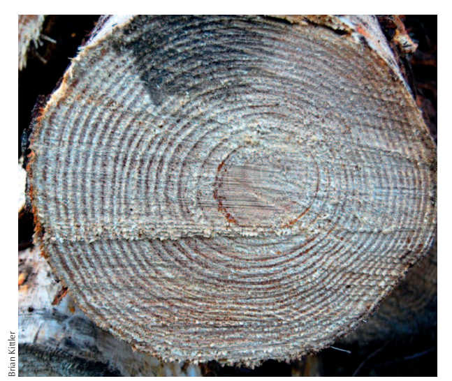
Growth rings show the region's productive capacity.

While participants generally concluded these points are important factors for why the market is locating in the region, discussion centered on whether sustainability should be measured by growth-to-drain ratios or should include other measures. There are new opportunities for additional wood-using industries in some places, while in others; demand for low-grade pulpwood continues to be strong, even without demand from energy markets. In these places, the growth-to-drain ratio may already be even or declining. Still, participants generally recognized that there are places on