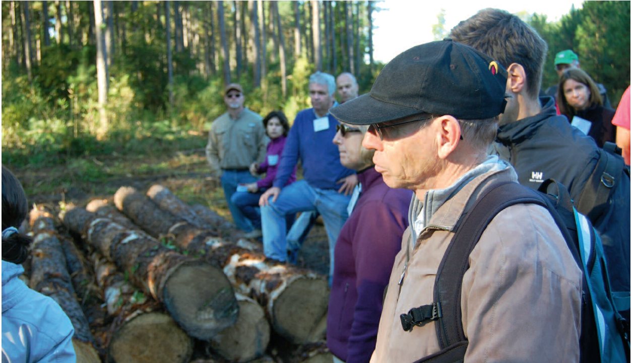
Workshop participants from the US and Europe learning how fiber moves to market in the Coastal Plain of Georgia.

Substantial common ground was established among the diversity of organizations and individuals participating. There is an active interest from all parties in follow-on dialogue that would allow remaining differences to be addressed and workable solutions found. Some of the participants who were most doubtful about the feasibility of addressing European concerns over sustainable sourcing prior to the workshop, from both Europe and the US, were subsequently among those expressing the strongest reassurance that practical solutions can be found. Several in attendance recommended follow on discussions to resolve remaining issues, including a repeat of such an event in a year's time. Stakeholders identified a common purpose in identifying meaningful criteria so that buyers have reliable assurance that standards are being met, sellers have viable markets, and the public gets renewable energy without harming the environment.