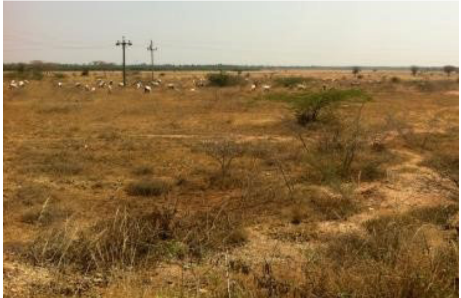
Photo of wasteland in India.