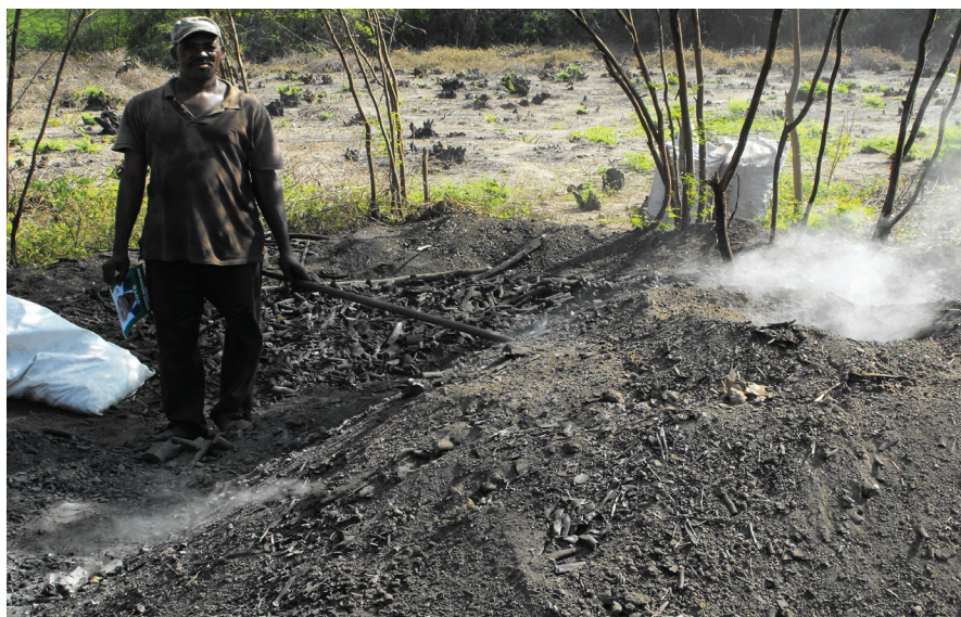
Dependence on woodfuels is greatest in developing countries where they provide about one-third of the total energy. For many households, especially rural, they are the primary fuel for cooking and heating.

WOODFUELS are biofuel derived from trees and shrubs (woody biomass) grown on both forest and non-forest land. Dependence on woodfuels is greatest in developing countries where they provide about one-third of the total energy. For many households, especially rural, they are the primary fuel for cooking and heating. Woodfuels are also important in food processing industries in developing countries for baking, brewing, smoking, curing and producing electricity. In developed countries, especially in the Nordic countries, woodfuels are increasingly used as a climate friendly alternative to fossil fuels for generating heat and power and woodfuels are also promoted as a means of reducing energy imports. Furthermore, woodfuels can be beneficial for local economic development; due to high transportation costs, woody biomass is preferably processed near its production site, thus generating local jobs and income.