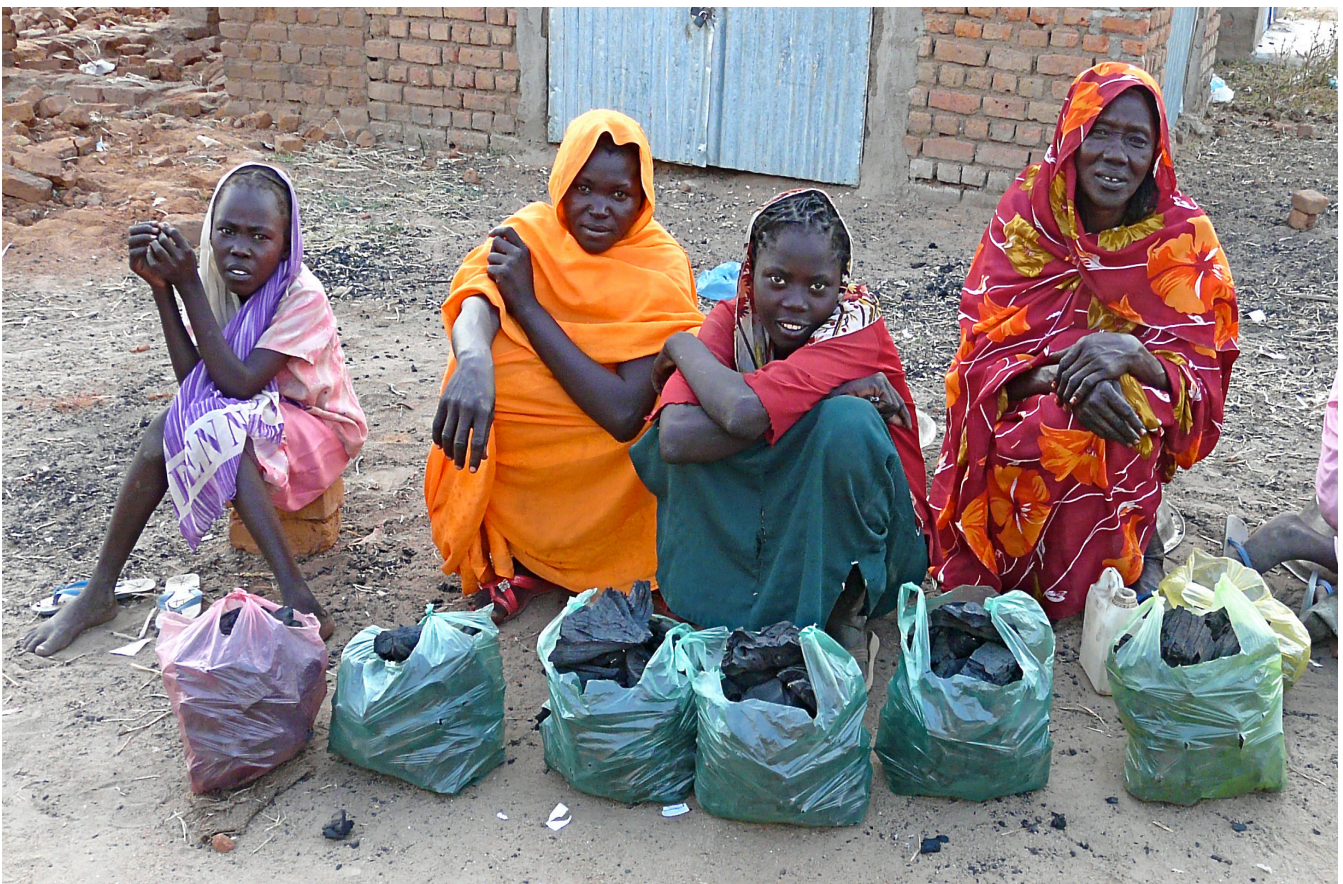
Women have an important role in collecting fuelwood for domestic use in developing countries.