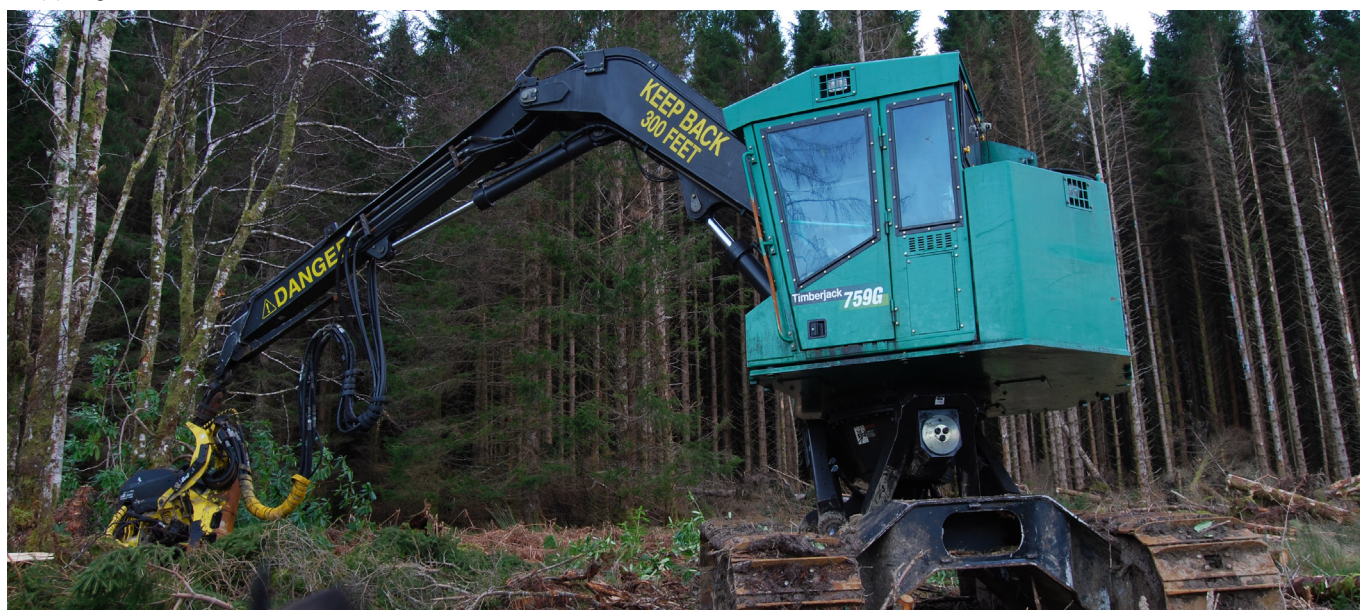
Policy-makers and decision-makers should acknowledge the potential and benefits of sustainable woodfuel production and be aware of the environmental, social and economic risks of unsustainable production.

This publication is produced in collaboration with Task 43 within the Implementing Agreement on Bioenergy, which forms part of a programme on international energy technology collaboration undertaken under the auspices of the International Energy Agency. This brief has been financed through the Forest Initiative and does not necessarily reflect the view of the three main partners of the Initiative. Responsibility for its contents rests entirely with the author.